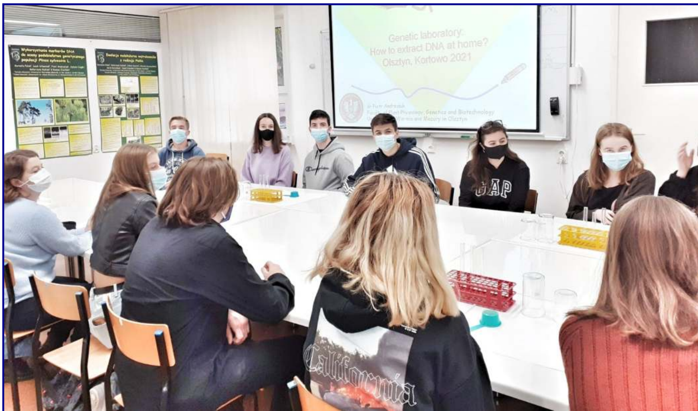
Los alumnos de los diferentes países del Erasmus+ en sesión de trabajo en Polonia y conociendo la ciudad.

• Second day: On the second day, we met the Erasmus boys and girls at the Copernicus Center. In the afternoon, we visited the Arkadia shopping center in Warsaw, and at the end it came the most