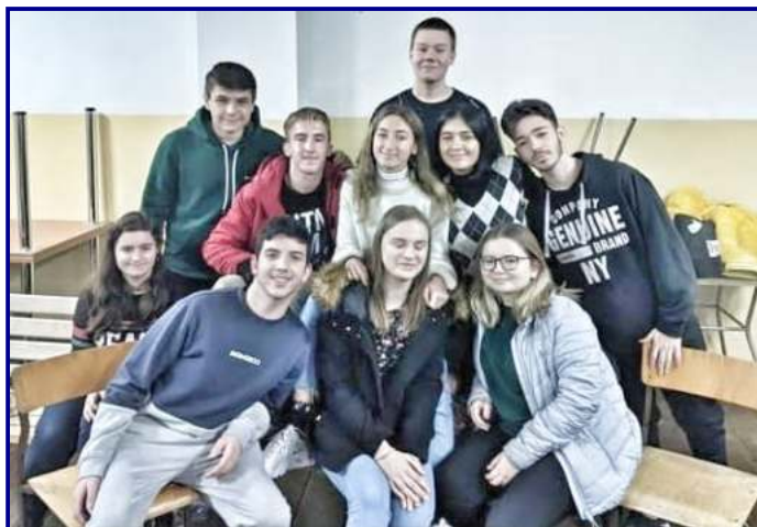
Foto recuerdo del grupo de alumnos en su estancia en Polonia Noviembre-21.

On Saturday we were able to visit Warsaw. We saw the museum and it was really sentimental. There, we could learn about the whole history of Poland during the war and some things made me feel really sad, everything that happened there was terrible. When